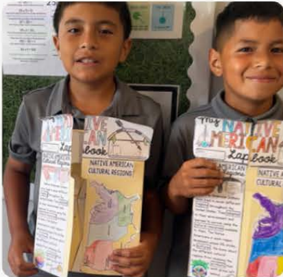
Project Time! Incredible look into Native American history!