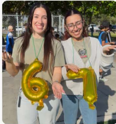
SIX SEVEN Costume for the WIN!