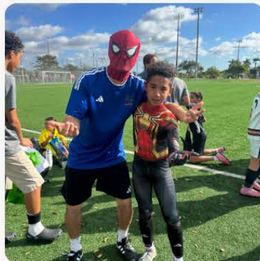
Spiderman guest appearance on the pitch!