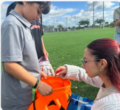
Halloween celebrations and treats were a great joy!